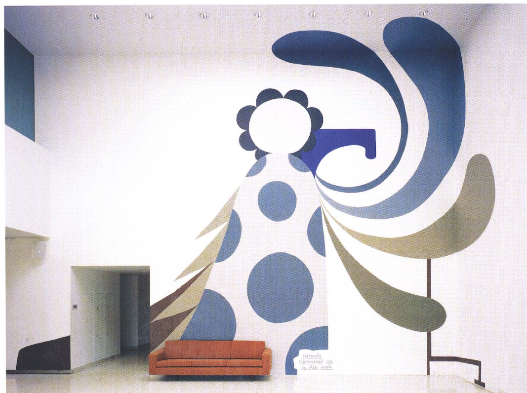
'Towards Friendliness, Childishness and Stupidity'